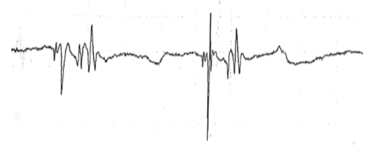
Figure 1 Electromyogram of right deltoid

Repetitive compound muscle action potential (R- CMAP) was present in the right abductor digiti minimi. Electromyography revealed myopathic potentials in the right deltoid (Fig 1). A trial of fluoxetine [6] was given, while tapering